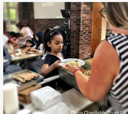
Oasis Charitable Trust UK