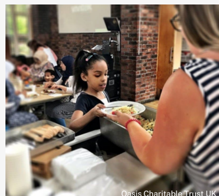
Oasis Charitable Trust UK